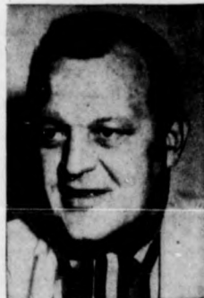
BYRON F. NACK

FEATURING: Stone Foundation, Foyer Entrance, Large Living Room, Full Dining Room, Modern Kitchen, Natural Wood Cabinets—Formica Work Surface, Entrance to Recreation Room from Kitchen, Extra Wide Garage—storage space in garage, Powder Room in Vestibule, Finished Mahogany Recreation Room, Large Covered Patio in front, Wrought Iron Railings, Bow Window, Tile Sills Throughout, Cathedral Ceiling, Exhaust Fan, Ample Space for Utilities, Ample Storage Rooms, Williamson Hot Air Gas Heat, Copper Piping Throughout, Three Large Size Bedrooms, 1½ to 2½ Bathrooms, Large Closets, Ceramic Tile Bathroom, Formica Vanity, Colored Bathroom Fixtures, Insulated, Upstairs Vestibule, Picture Window in Recreation Room, 100 A Wiring.