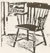
Lycoming College Chairs

A DISTINCTIVE PIECE OF FURNITURE DESIGNED TO ADD LASTING GRACE AND BEAUTY TO YOUR HOME