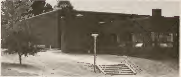
Lycoming College's almost-completed Physical Education and Recreation Center. This view is looking southeast from the Academic Center. The windows identify the office area.