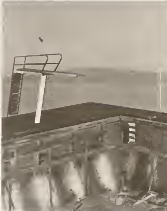
Some tile still needed to be laid and hardware had to be installed, but the swimming pool was almost finished at the beginning of June.