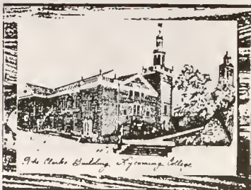
FIRST IN A SERIES OF FOUR ETCHINGS COMMISSIONED BY LYCOMING COLLEGE AVAILABLE NOW