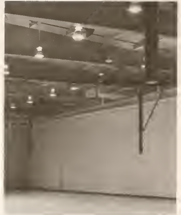
Bleachers for the new gymnasium arrived about a week after this photograph was taken. Note the basketball backboard supports hanging from the ceiling.